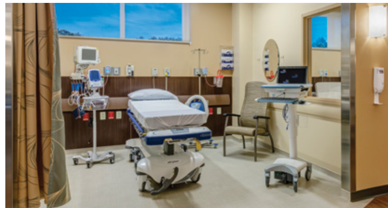
Patients will have private pre- and post-operative recovery rooms.