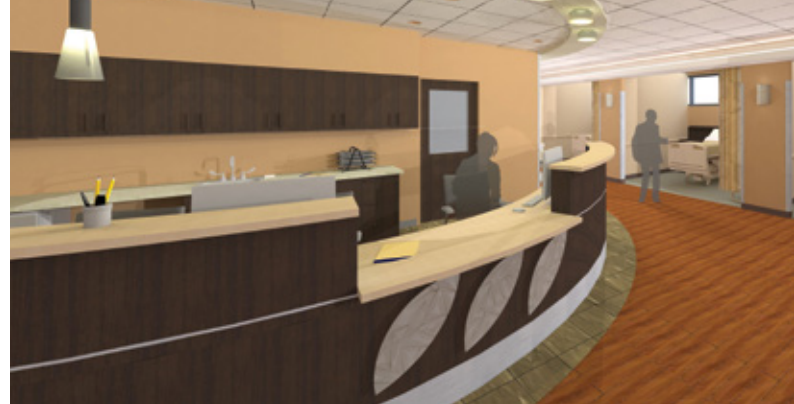
Architect’s rendering of the recovery area nurses’ station.